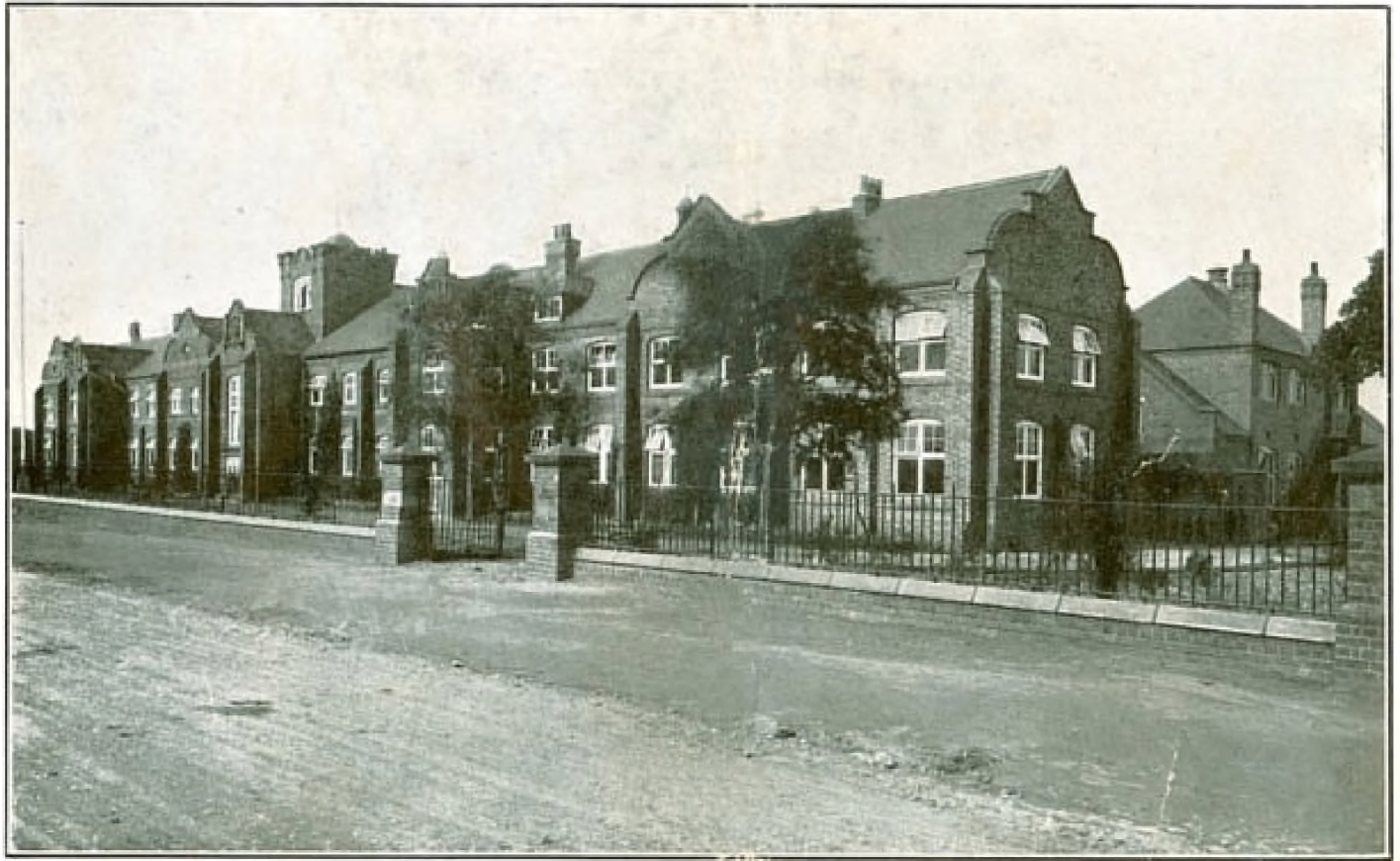
FRONT VIEW OF ORPHANAGE.