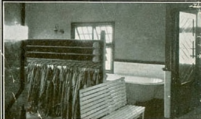
CORNER OF BATHROOM, NO. 1 DORMITORY