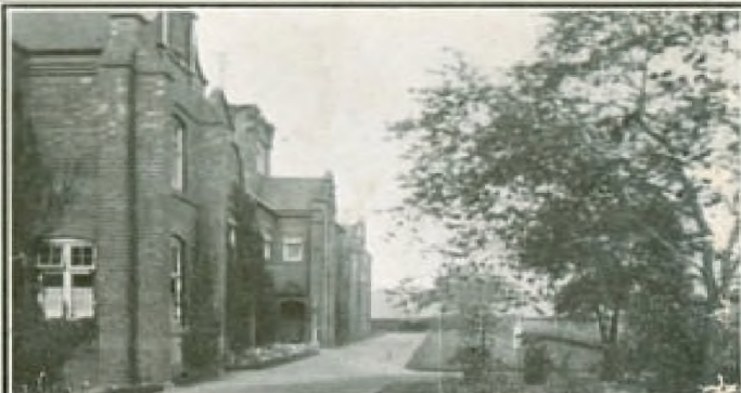
REAR VIEW WITH ROSE GARDEN.