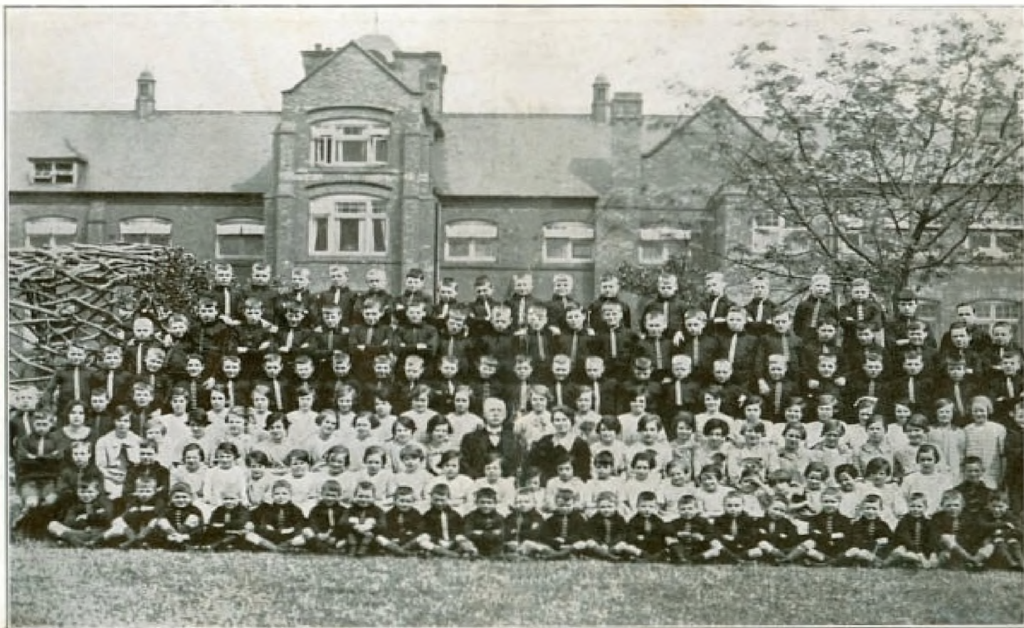
OUR BOYS AND GIRLS, MATRON AND SECRETARY.