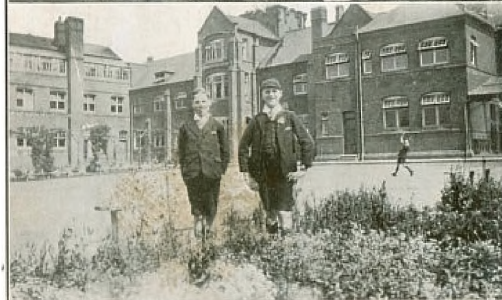
THE AMATEUR GARDENER