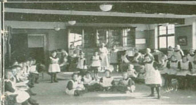
BOYS IN RECREATION HALL