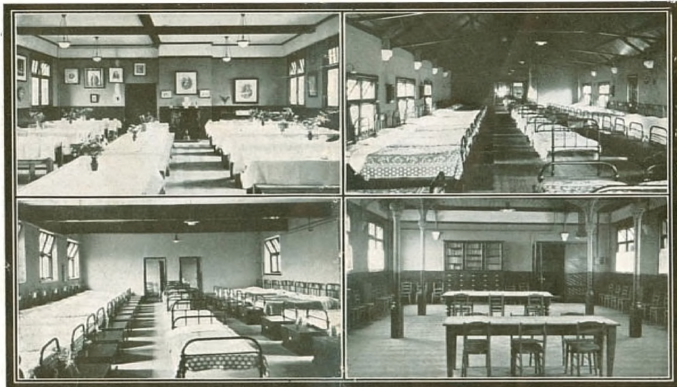
No. 5 DORMITORY