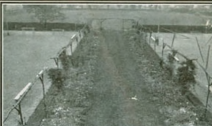
PLAYGROUNDS & TENNIS FIELD