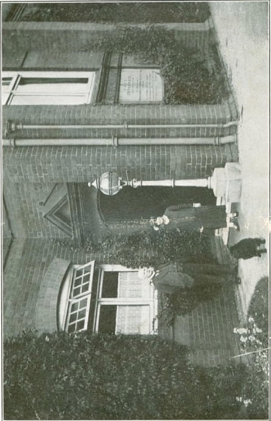
THE FOUNDER AND THE MATRON.