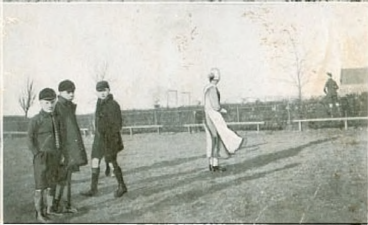
GAME OF FOOTBALL