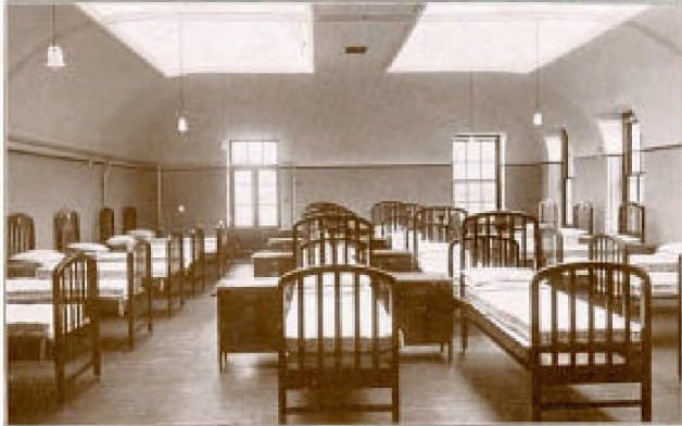
ONE OF THE DORMITORIES. THIS WAS FORMERLY PART OF THE PICTURE GALLERY. NOTE THE "SHORTBOYS."