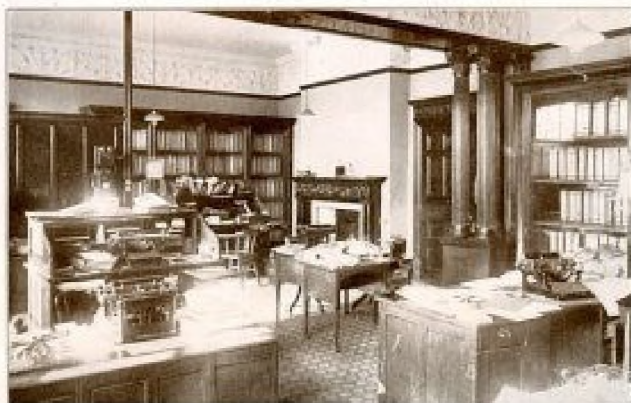
ONE OF OUR GRAND LODGE OFFICES.