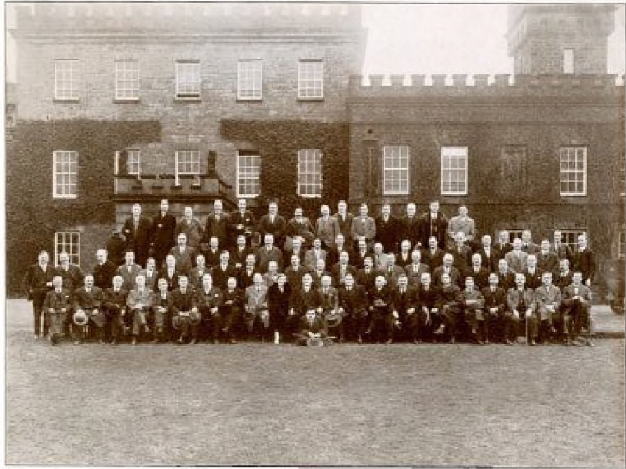
OUR GROVE HOUSE ORPHANAGE COMMITTEE, 1927.