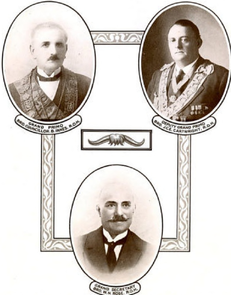
CHAIRMAN, VICE-CHAIRMAN, AND SECRETARY OF THE GROVE HOUSE COMMITTEE, 1927