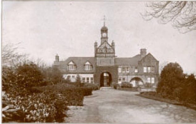
FRONT VIEW OF THE STABLES.

THE HOME OF OUR HEAD GARDENER WHO HAS BEEN ON THE ESTATE OVER 40 YEARS.