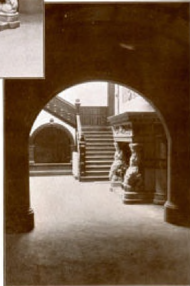
VIEW OF THE CELEBRATED CHIMNEY PIECE AND STAIRCASE.