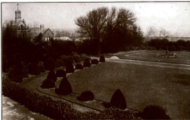
A VIEW OF THE GROUNDS.

The School is just opposite Grove House Entrance.